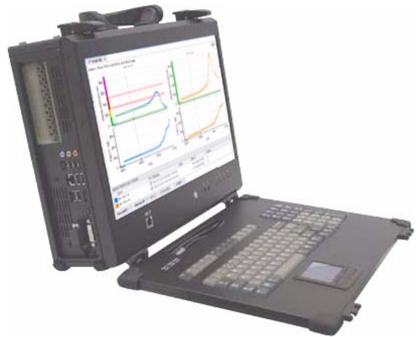
VibroSight portable analyser